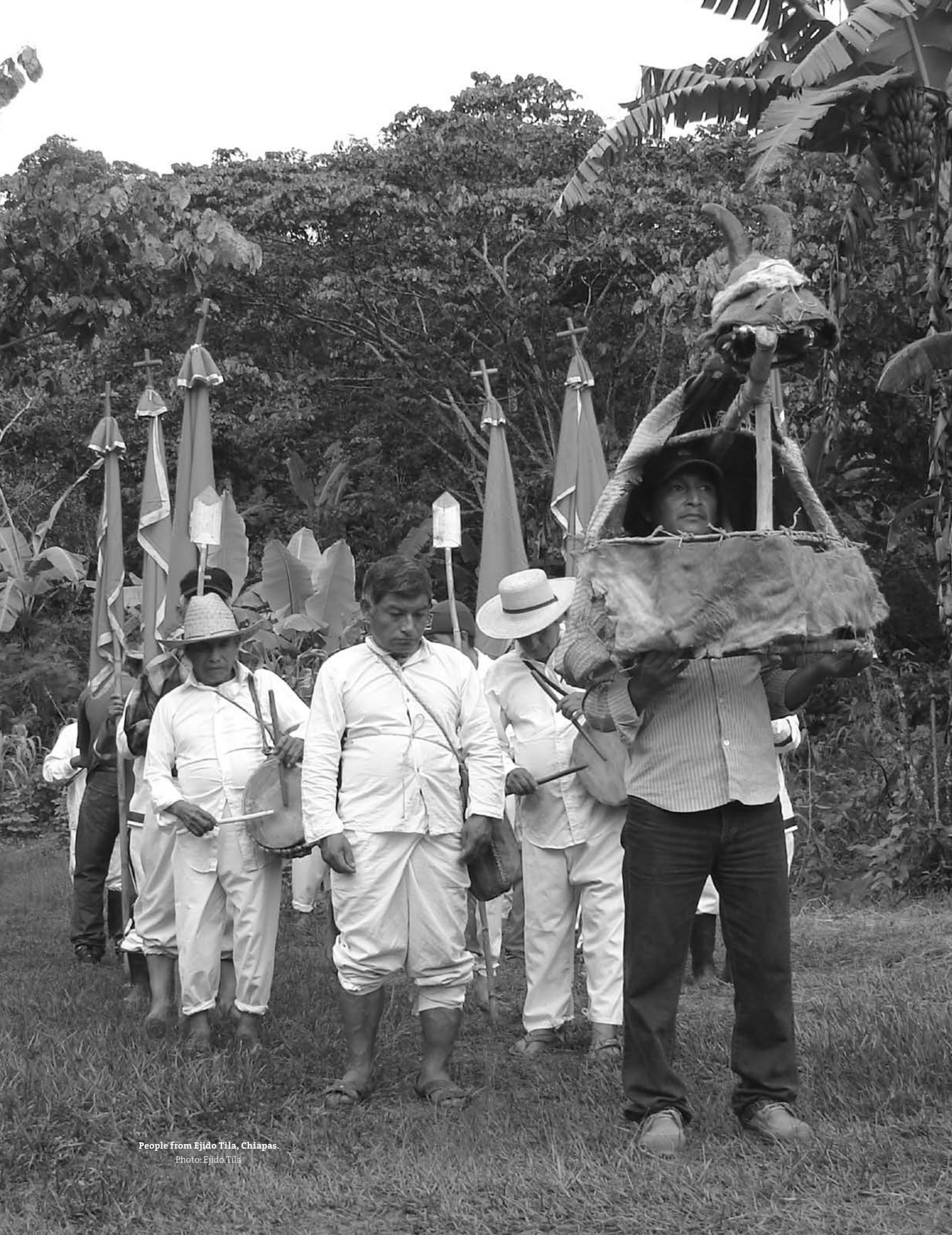
People from Ejido Tila, Chiapas.